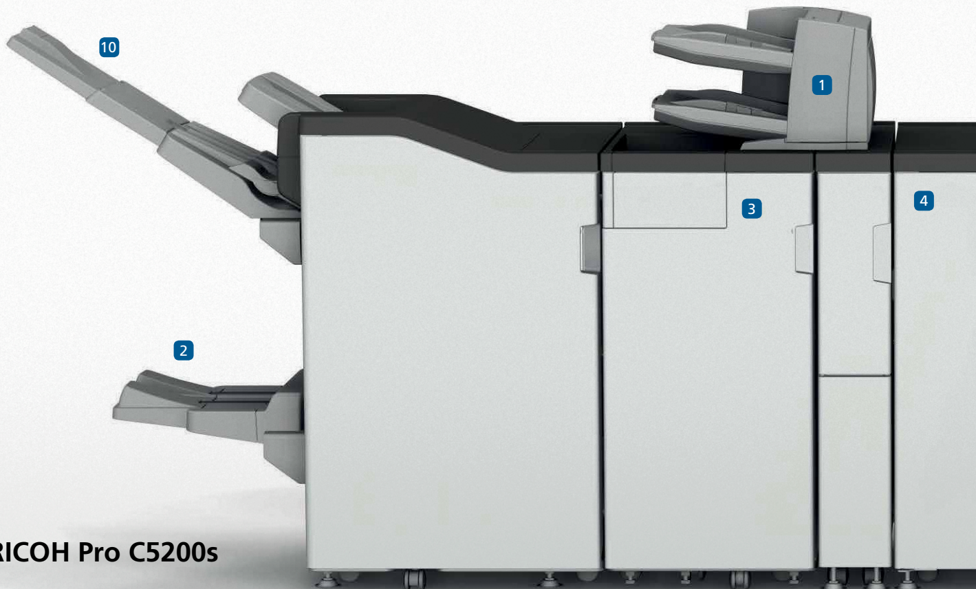
RICOH Pro C5200s