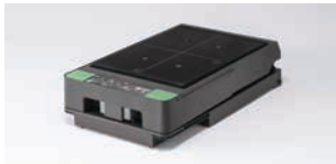
RICOH Tray for Standard Size Type 1 (A4)