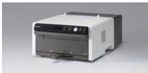
RICOH Rh 100 Finisher