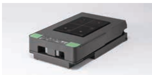
RICOH Tray for Small Size Type 1 (A5)